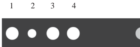
Dovetail Balance Bar — end holes for Tele Vue mounts, middle holes for camera/video tripods. Holes 1, 3 & 4 have ¼-20 threads. Hole 2 is for the anti-rotation pin found on camera/video tripods.

The captive dovetail mounting/balance bar, referred to simply as the balance bar, allows the Tele Vue-60 to be attached to a number of tripod or mount types, including camera/video, alt/azimuth or equatorial. It also slips into the Tele Vue SCT Bracket (SBB-1002) making the Tele Vue-60 the ultimate finder/Rich-Field accessory for your SCT! The thick aluminum bar provides a solid footprint and resists vibration. A thumb screw locks the balance position, while providing easy adjustment when necessary.